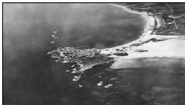
Aerial photo of Tyre made by French Air Force before 1934. File:Tyre-aerial-photo-by-France-Military-1934.jpg, (Public Domain)